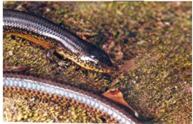
Fig. 16. Leptosiaphos ianthinoxantha . Cameroon, Mt. Oku, Oku Simonkou village. Picture: M. LeBreton, November 2002.

This small skink is endemic to montane grasslands of the Western Highlands of Cameroon (Schmitz et al. 2005) (Fig. 16). It is found at Mt. Lefo (Forest Reserve of Bafut-Ngamba) and in the Bamboutos Mountains. Its occurrence at Mt. Oku had been suspected by Wild in 1994. It is a semi-burrowing species living in open montane grasslands, and is oviparous. The species occurs up to 2,700 m altitude at Mt. Mekua in the Bamboutos where its populations are highly localized but occur in high densities.