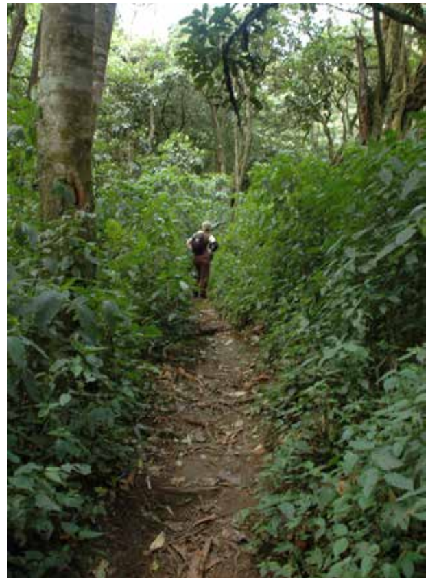
Fig. 2. The path leading from Oku Elak village to the summit of Mt. Oku is very popular and easy to access. Picture: I. Ineich, May 6, 2007.

This report provides a critical inventory of the reptile species recorded from the summit area (above 1,400 m elevation) of the BH, demarcated by the valley that separates it from Manengouba/Mt. Cameroon (less than 700 m) and the Tikar Plain that separates it from Tchabal Mbabo (Fig. 6). We also discuss the biogeographic affinities of the study region. Many of the reptiles found there are