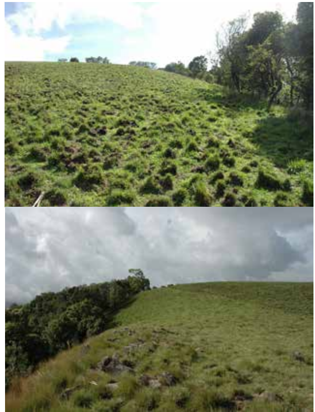
Fig. 22. The altitude grassland of the summit at Mt. Oku no longer harbors any reptile. Chameleons can still be found in the forest on the edge of the meadows, up almost 2,600 m above sea level. However, one can observe there a tiny endemic viviparous toad under the stones on the ground. Picture: I. Ineich, May 7, 2007.

Later he (Amiet 1975) defined a “oro-cameroon faunistic element” of species with distributions above 1,000 m elevation. The term “orobiontes” (here replaced with submontane species) was used for these high altitude species. Montane species also present in lower areas around mountains were also distinguished as “monticolous species.” Amiet (1987) estimated that the average annual temperature had lowered from 3.5 to 4.5 °C during the last glaciation in Cameroon, and showed that the altitudinal limit of 900 m to 1,000 m is an important ecological boundary, marking the exclusion of many lowland species and the appearance of true submontane species. This boundary in the BH, however was not at 1,000 m elevation but increased to 1,400 m, before a distinctive “submontane” herp assemblage occurs. The further mountain ranges are located from the sea the altitudinal limit for a species appears to increase. The separation of vicariant Cameroon “submontane” reptile assemblage is relatively recent and seems to mainly date from 25,000 to 15,000 BP (Amiet 1987).