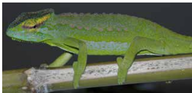
Fig. 10. The neotype of Trioceros serratus, MNHN-RA 2007.1494, photographed several days after his capture (see also other photographs below).