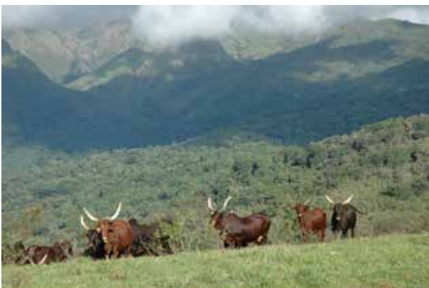
Fig. 1. The beautiful cattle of the Fulani herdsmen observed on pastures high in the region of Mt. Oku are fat and healthy. 6.21°N and 10.44°E. Picture: I. Ineich, May 8, 2007.

Mt. Oku (rarely called Mt. Kilum: 6.12°N and 10.28°E, elevation 3,011 m) is located in the most septentine part of the BH, not far from the transition zone between mountain forest and savanna. Summits above 2,800 m are covered with an afro-alpine grassy lawn (Fig. 1), devoid of