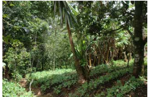
Fig. 8. Associated crops (beans, coffee, bananas, corn) encountered near villages (here around Elak Oku village) are not completely adverse to chameleons when a large plant and shrub cover is maintained. Picture: I. Ineich, May 8, 2007.

2005.2736 (three specimens, Awing village (Benjom), 5.867°N and 10.266°E, elev. 1,747 m, coll. CamHerp M. LeBreton and L. Chirio, December 14, 2002) – MNHN-RA 2005.2735 (Awing village (Benjom), 5.867°N and 10.266°E, elev. 1,747 m, coll. CamHerp M. LeBreton and L. Chirio, July 8, 2002 – MNHN-RA 2005.2737 (Baba II village, 5.857°N and 10.102°E, elev. 1,772 m, coll. CamHerp M. LeBreton and L. Chirio, December 14, 2002) – MNHN-RA 2005.2738-2744 (seven specimens, Baba II village, 5.857°N and 10.102°E, elev. 1,772 m, coll. CamHerp M. LeBreton and L. Chirio, July 8, 2002 [MNHN-RA 2005.2739, .2741 and .2743: December 14, 2002]) – MNHN-RA 2005.2745 (Bamboutos, Mt. Mekua, 5.688°N and 10.095°E, elev. 2,700 m, coll. CamHerp L. Chirio, March 30, 2000) – MNHN-RA 2005.2748 (Bingo village, 6.166°N and 10.290°E, elev. 1,435 m, coll. CamHerp M. LeBreton and L. Chirio, December 14, 2002) – MNHN-RA 2005.2749-2752 (four specimens, Mt. Oku, Elak Oku village, 6.202°N and 10.505°E, elev. 2,000 m, coll. CamHerp M. LeBreton and L. Chirio, July 8, 2002) – MNHN-RA 2005.2755-2759 (five specimens, Mbiame, 6.190°N and 10.849°E, elev. 1,955 m, coll. CamHerp M. LeBreton and L. Chirio, July 8, 2002 [MNHN-RA 2005.2758-2759: December 14, 2002]) – MNHN-RA 2005.2760-2761 (two specimens, Mbockghas, elev. 2,092 m, coll. CamHerp M.