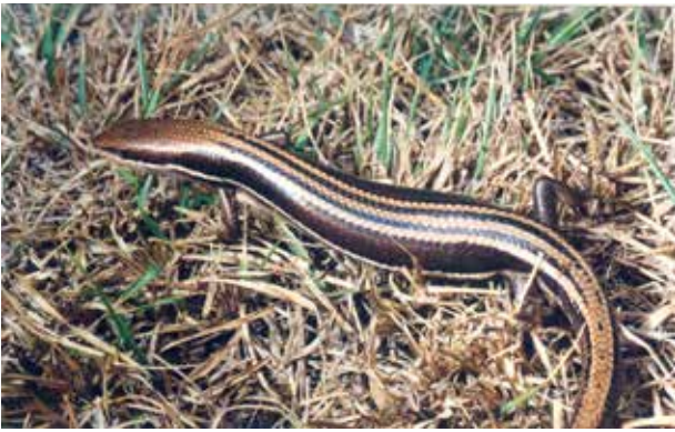
Fig. 18. Trachylepis mekuana . Mt. Mekua, Bamboutos. March 18, 2002.