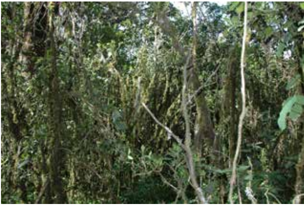
Fig. 3. Just before the summit of Mt. Oku, the vegetation is covered with dense epiphytic altitude plants. Picture: I. Ineich, May 6, 2007.