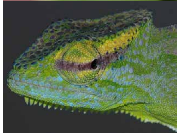
Fig. 13. Individuals assigned to T. serratus altitude populations (top, Elak Oku village; MNHN-RA 2007.1463) differ from those from lower altitudes like here (bottom) the neotype of T. serratus (MNHN-RA 2007.1494) by some important scalation and coloring characters.