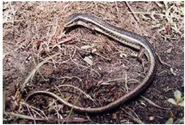
Fig. 15. Lacertaspis lepesmei. MNHN-RA 2004.0061 (see above).