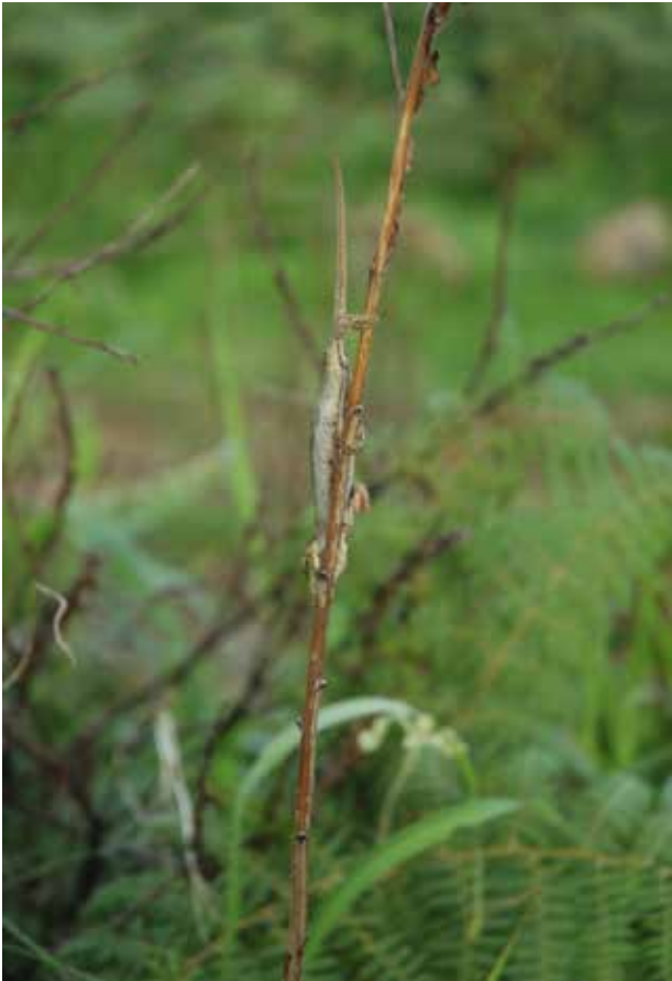
Fig. 12. Trioceus serratus widely used the herb layer where it was comfortable. Here an individual seeking to hide on a blade of grass by stiffening its tail to make it look like an herbaceous branching. Not collected. Picture: I. Ineich, May 8, 2007.

2010). Our study allows addition of the following locations in the BH: Awing (Benjom), Baba II, Bali Ngemba, Bingo, Mbiame, Mbockghas, Mboh, Mufe, Njinkfuin, Tefo, and Veko. It was reported from Bafut (elev. 1,200 m, 6.08°N and 10.10°E) by Joger (1982) as Chamaeleo wiedersheimi .