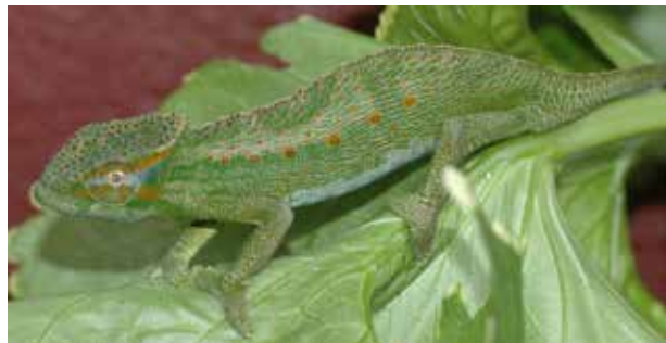
Fig. 9. Trioceros serratus male observed near a house in the village of Elak Oku at Mt. Oku. MNHN-RA 2007.1463.