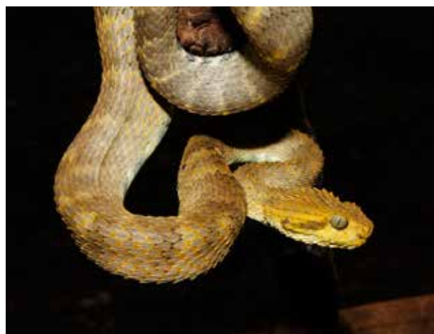
Fig. 21. Atheris broadleyi . Megangme, 4.598°N and 12.225°E, elev. 610 m, September 8, 2012.

This big forest viper was reported from Bafut (elev. 1,200 m, 6.08°N and 10.10°E) by Stucky-Stirn (1979) and found at 1,500 m in the western extension of the BH, and also at Mende in the Takamanda. It was observed by one of us (LC) at almost 1,500 m near Bangangte. In Cameroon it is found at altitudes between 5 m and only