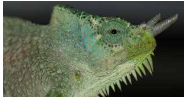
Fig. 7. Despite its specific name, individuals of T. q. gracilior may have two to six horns. Adult male, Elak Oku village, Mt. Oku. Note the presence of concentric rings on the horns, a characteristic feature (synapomorphy) of the genus Trioceros. MNHN-RA 2007.1424.