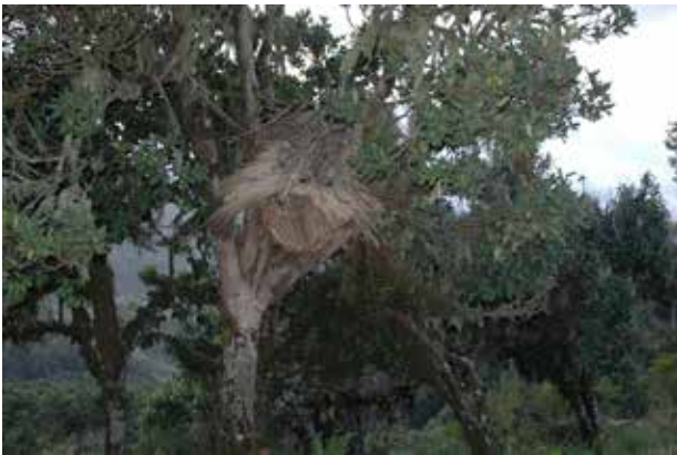
Fig. 5. Hives, placed high in the trees almost to the top of Mt. Oku (here), produce a thick, white honey of excellent quality, highly sought after. Picture: I. Ineich, May 7, 2007.

endemic mountain species whose distribution is restricted and unfortunately now highly fragmented. Our knowledge of this herpetofauna has been greatly improved by field work undertaken under the CamHerp project which ultimately resulted in the publication of a complete Atlas of the reptiles of the country (Chirio and LeBreton 2007). The BH, as defined above, hosts 50 non avian reptile species among which 16 are endemic to our study area.