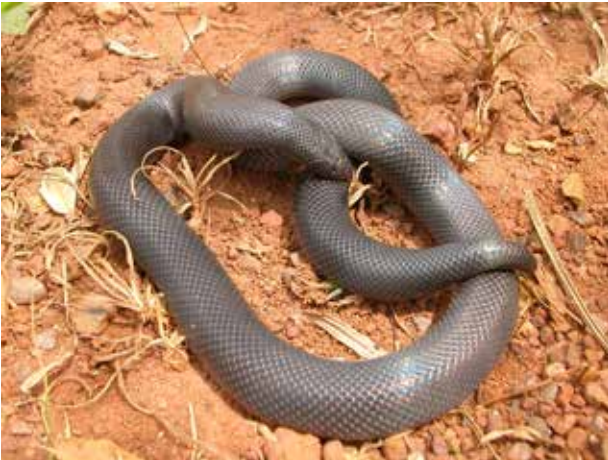
Fig. 19. Atractaspis i. irregularis – Cameroon, Yaounde. January 4, 2011.

the IUCN Red List and habitat conservation measures should be a priority.