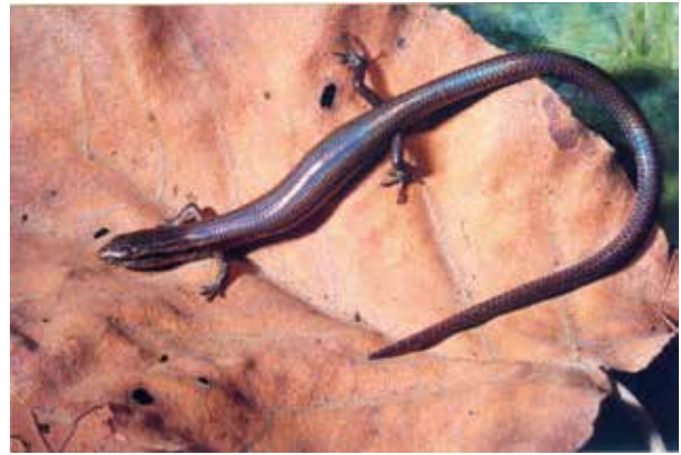
Fig. 17. Leptosiphos vigintiserierum . Cameroon, Mt. Mekua, Bamboutos. Specimen CamHerp 36431. Picture: M. LeBreton, March 12, 2002.

ember 14, 2002 [1938]) – MNHN-RA 2005.1944 (Veko village, 6.139°N and 10.578°E, elev. 2,044 m, coll. CamHerp M. LeBreton and L. Chirio, December 14, 2002) – MNHN-RA 2005.1958-1959 (two specimens, Sarkong Hill, west of Jakiri, 6.054°N and 10.598°E, elev. 1,600 m, coll. CamHerp, March 19, 2002) – MNHN-RA 2005.2484 (Tefo village, 6.30°N and 10.37°E, elev. 1,700 m, coll. CamHerp M. LeBreton and L. Chirio, July 8, 2002).