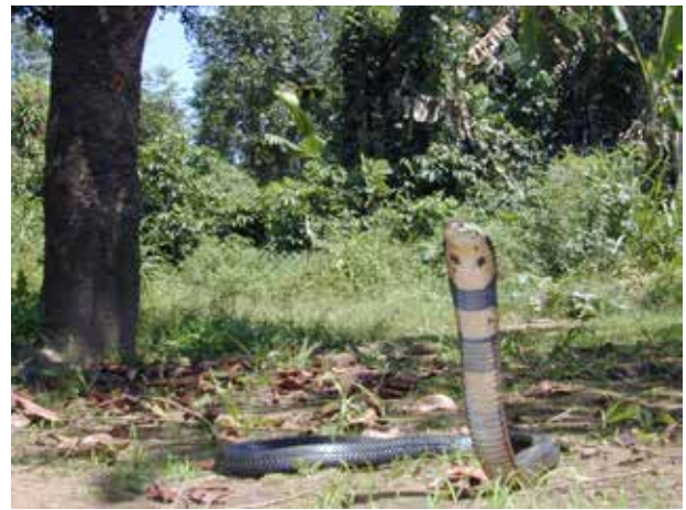
Fig. 20. Naja melanoleuca . Cameroon, Bamessing, October 31, 2003.

The validity of this family was recently demonstrated by Kelly et al. (2011). This work showed that the genus Lamprophis was polyphyletic. A new genus was created and other species previously included in the genus Lamprophis were divided into three groups: (1) virgatus and fuliginosus , together with lineatus and olivaceus were transferred to the revalidated genus Boaedon A.M.C. Duméril, Bibron, and A.H.A. Duméril, 1854; (2) Lycodonormorphus was nestled within Lamprophis sensu lato and a sister taxon of Lamprophis inornatus —the latter species was therefore transferred to the genus Lycodonormorphus ; (3) Lamprophis sensu stricto was restricted to a small clade of four species endemic to South Africa, with Lamprophis aurora as type species. We follow this revised taxonomy here.