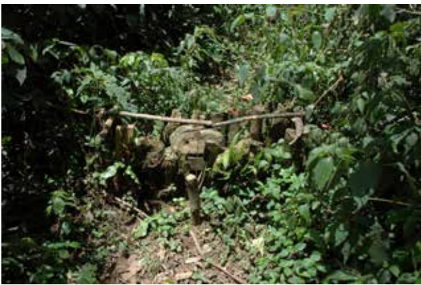
Fig. 4. Villagers apply strong pressure on the fauna and flora of Mt. Oku forests. It is common to find traps to catch bush meat, here a brush-tailed porcupine (a forest porcupine species). Picture: I. Ineich, May 6, 2007.